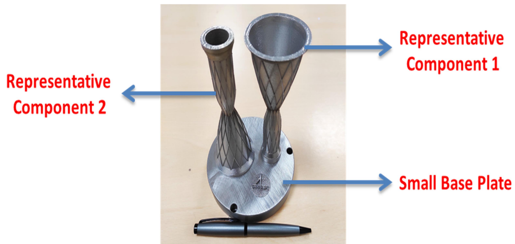
Figure 1: Showing representative components with large base plate